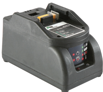
Convenient battery removal system.

Battery charger will ensure protection on thresholds for temperature and internal pressure of the charging batteries to improve quality and increase battery life.