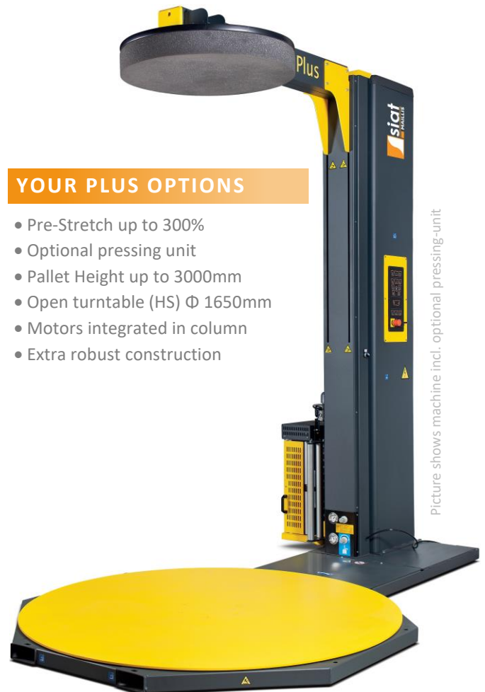
Picture shows machine incl. optional pressing-unit